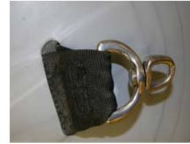
S/S Rotating Eyelet